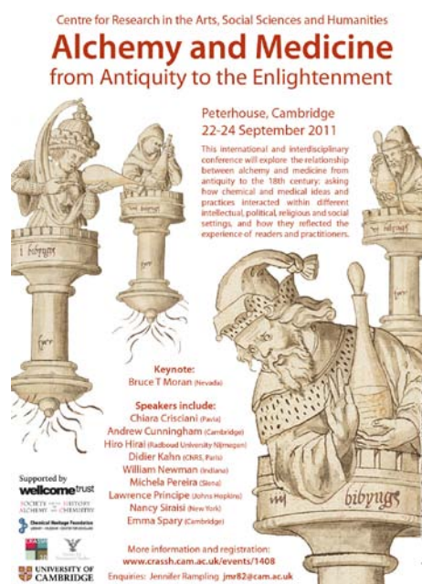
The conference poster, featuring images from the Fitzwilliam Museum's 'Ripley Scroll.'